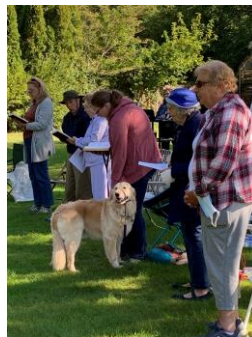
Blessing of the Animals