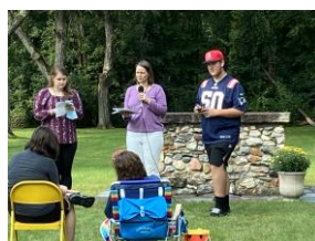
Common Cathedral Service