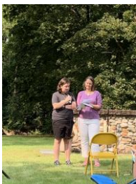
Common Cathedral Service