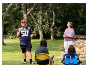
Common Cathedral Service