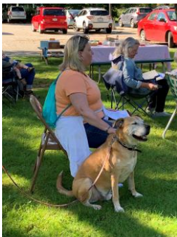
Blessing of the Animals