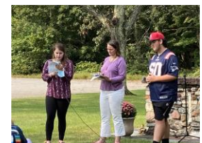
Common Cathedral Service