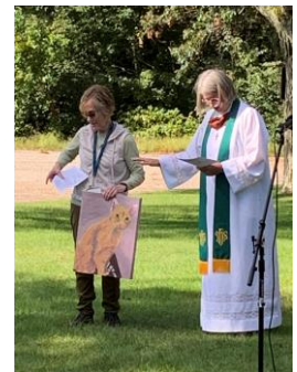
Blessing of the Animals