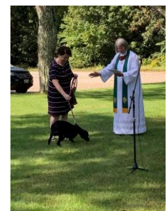
Blessing of the Animals