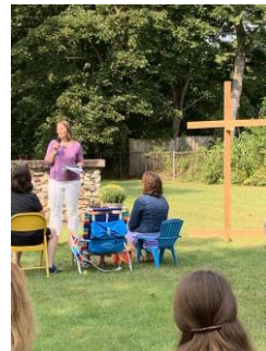
Common Cathedral Service