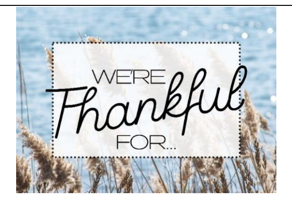
Thank you so much for the wonderful send off. The room was beautiful and the food

We continue to follow current Health Department COVID protocols. Masks are optional in the building; however, we ask that you please continue to maintain a distance between you and others. Thank you for caring for others by engaging in these simple acts.