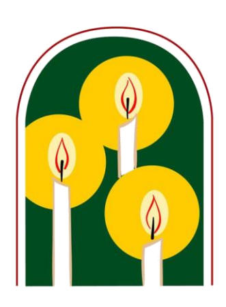
Calm & Candlelight TAIZE SERVICE